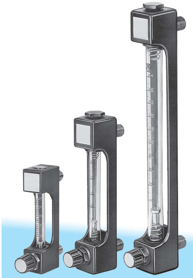
Fig. 1 F VA Minix variable area meter