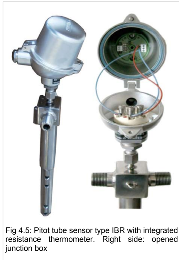
Fig 4.5: Pitot tube sensor type IBR with integrated resistance thermometer. Right side: opened junction box

The temperature sensor is positioned along the sensor axis in between the two pressure channels. After all thermic adjustments in the vicinity of the temperature sensor it measures the fluid temperature along the pipe axis.