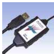
MACTek Corporation HART Modem Model 010031 (USB Connection)

The HART communication interface recommends an HART modem made by MACTek Corporation using in Control Valve Maintenance System “Valstaff”.