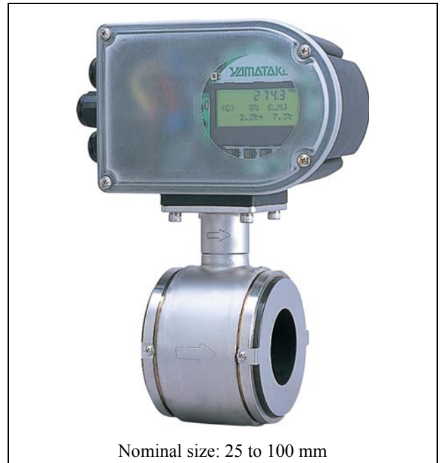
Nominal size: 25 to 100 mm

It measures the flow rate of chilled water/water with glycol/hot water and calculates calorie consumption with its two temperature inputs (supply and return).