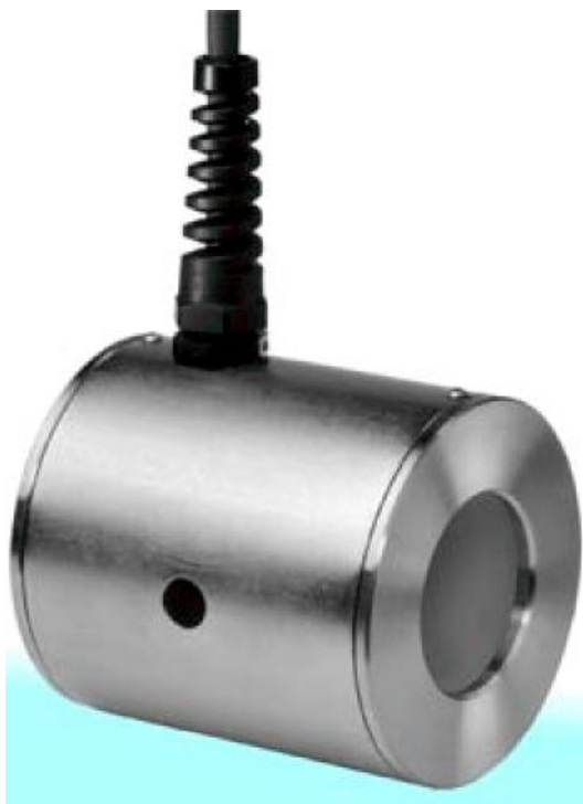
Fig. 1 Electromagnetic flow Sensor mag-flux S